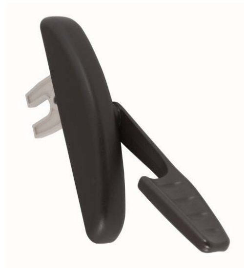
(Tempo Lock #24.5X)