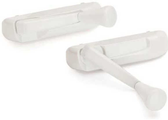
(Encore Handle/Cover #14267 & #14268)

As is shown on the images below, these ADA style hardware options offered by AmesburyTruth, have a larger diameter and longer contour shape which make them easier to operate, and consequently will help window manufacturers meet ADA requirements on their window systems.