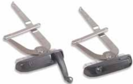
Folding Handle With Maxim Accessory Cover

Truth's new nesting folding handle covers are a perfect complement to the already popular line of retractable handles designed to minimize interference with window treatments such as curtains and blinds. This new accessory cover provides a convenient cradle for the folding handle producing a smooth and cleaner overall appearance. It makes it easy to change the color of hardware and is available in a wide range of finish options—both plated & painted. Its removable cover makes it easier to paint or stain the windows.