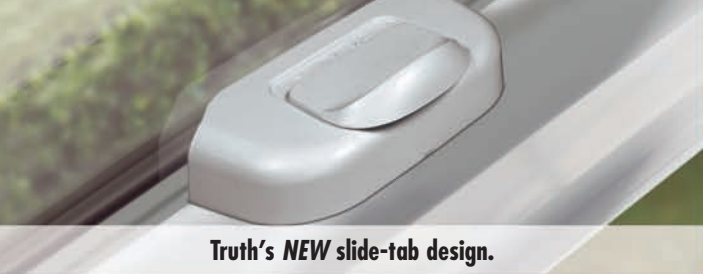
Truth's NEW slide-tab design.