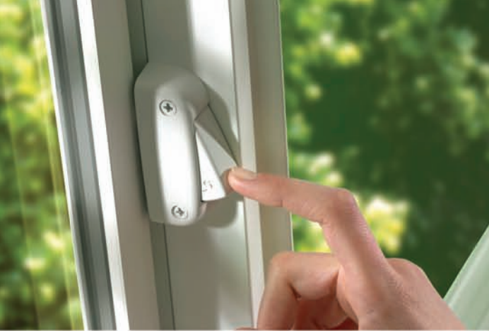
Truth's original push-button design.